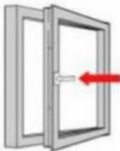
Turn the handle HORIZONTALLY: window opened